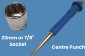
22mm or 7/8" Socket